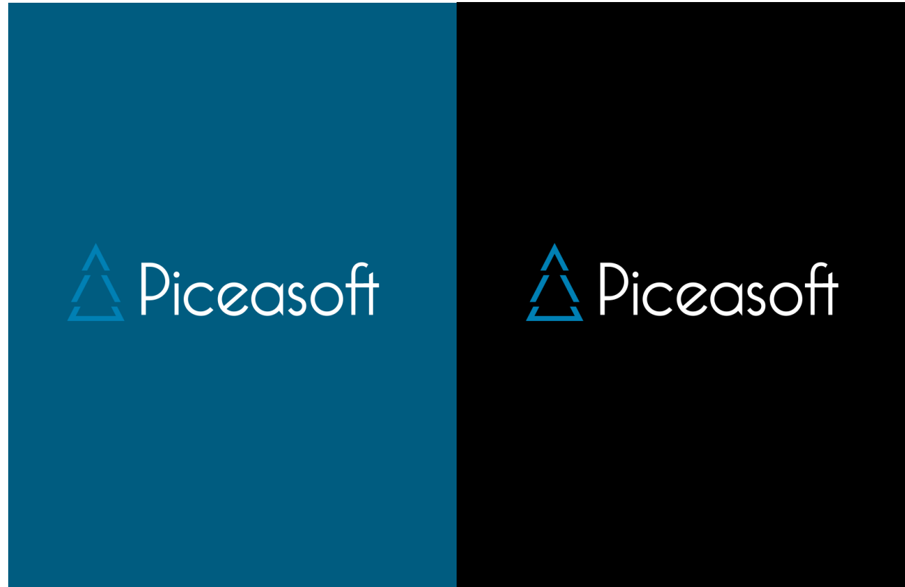
Example background colors